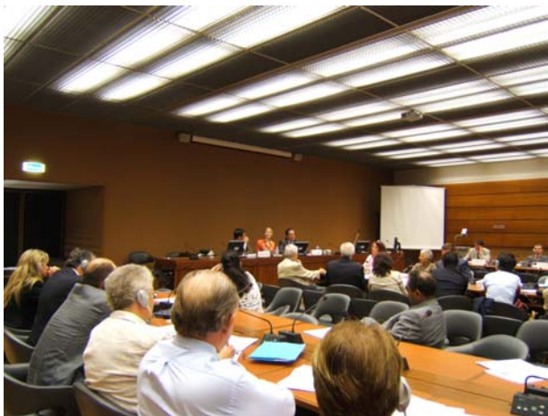
General view of the 1 st session