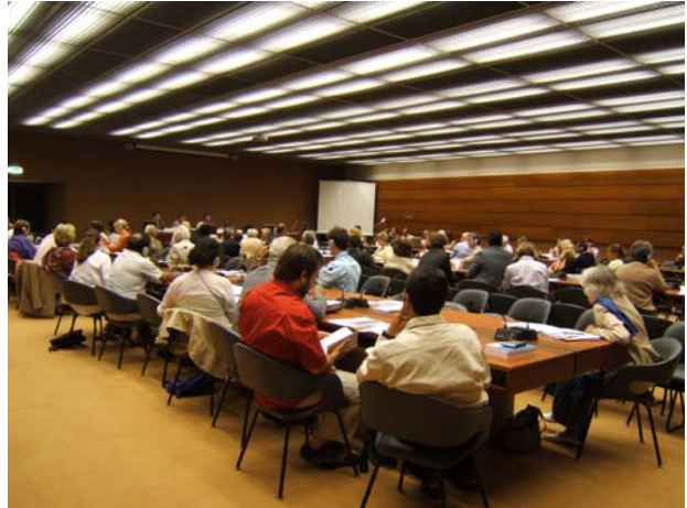
View of the public participating in the Hearings